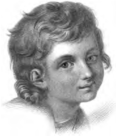
Prince Albert at the age of four.